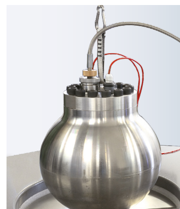
DCA 25 bomb