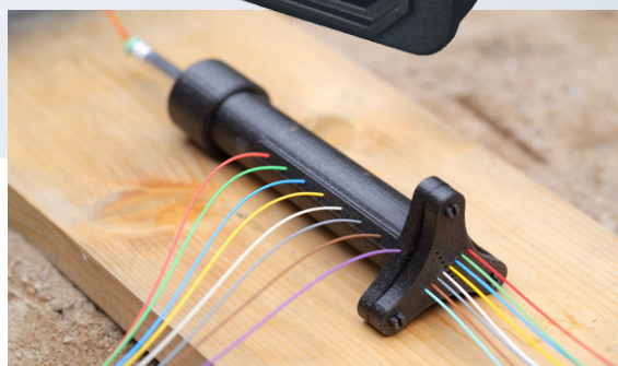
Simultaneous detonation velocity and shock curvature measurement.