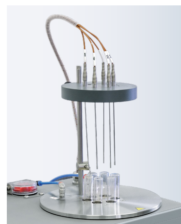
AET 402 – detail of the furnace