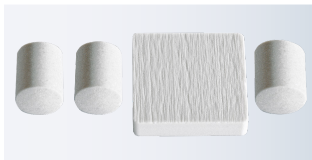
Porcelain pegs and a plate