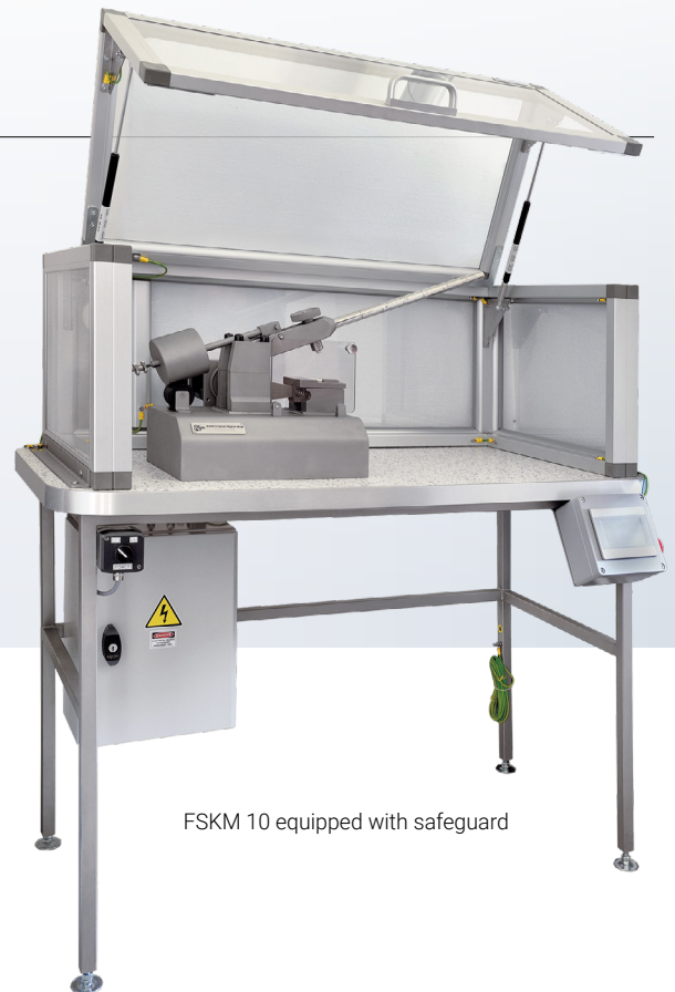
FSKM 10 equipped with safeguard