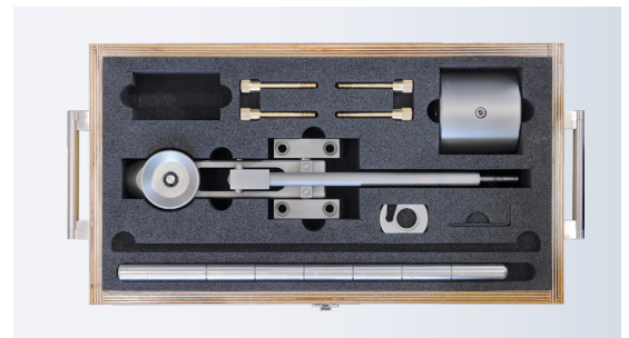
6-position loading arm BAM 6A (dismantled)