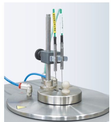
DTA 552-Ex – detail of the furnace