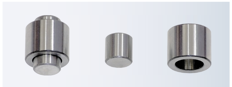
BAM Fall Hammer (Impact Tester) – steel cylinders and guide rings