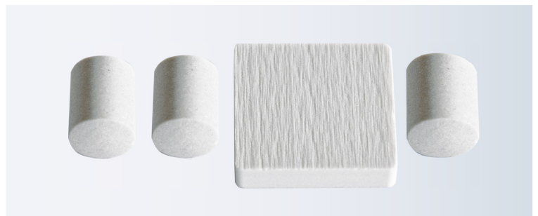
BAM Friction Apparatus – porcelain pegs and a plate