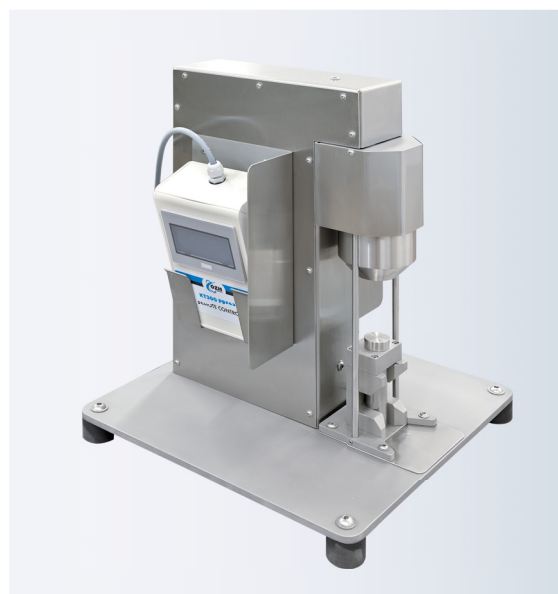
Tamping device for sample preparation